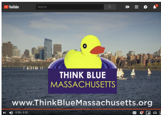
View the ad at http://bit.ly/tbm-fowl-water

On behalf of the members of the Connecticut River Stormwater Committee, Think Blue Massachusetts ran an educational advertising campaign from May 31st to June 17th, 2022. The “Fowl Water” (In both English and Spanish) video helps viewers visualize stormwater pollution in their community: