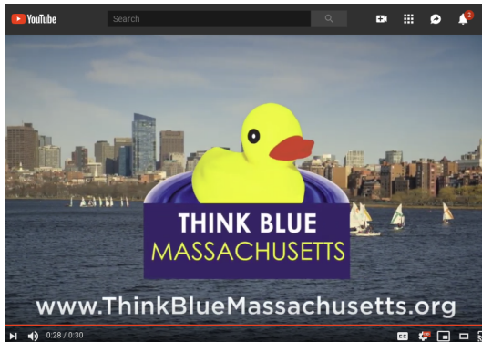
View the ad at http://bit.ly/tbm-fowl-water

On behalf of the members of the Neponset Stormwater Partnership, Think Blue Massachusetts ran an educational advertising campaign from May 31st to June 17th, 2022. The “Fowl Water” (In both English and Spanish) video helps viewers visualize stormwater pollution in their community: